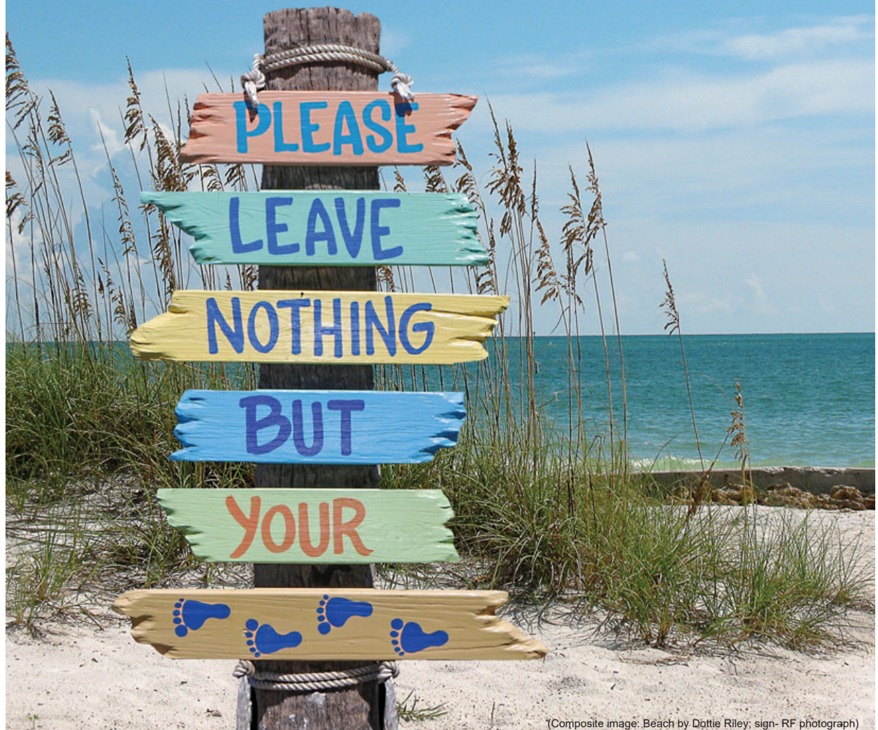
(Composite image. Beach by Dottie Riley; sign- RF photograph)